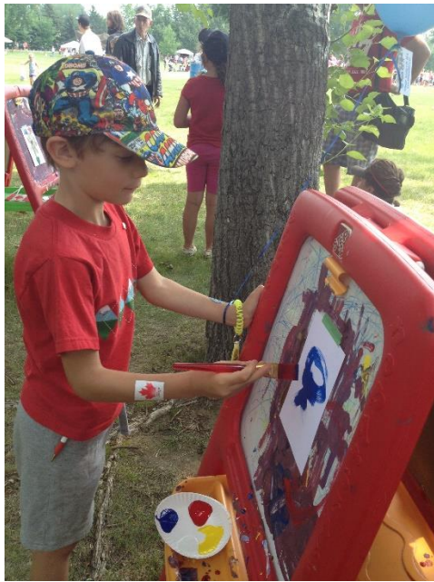
Art in the Park Canada Day, Kin Coulee Park

We have maintained our strong partnership with the Parent Link Center. Our parent information board is updated about four times a year. This board allows us to connect with a wider range of parents and share information on quality licensed and approved care or early childhood development information.