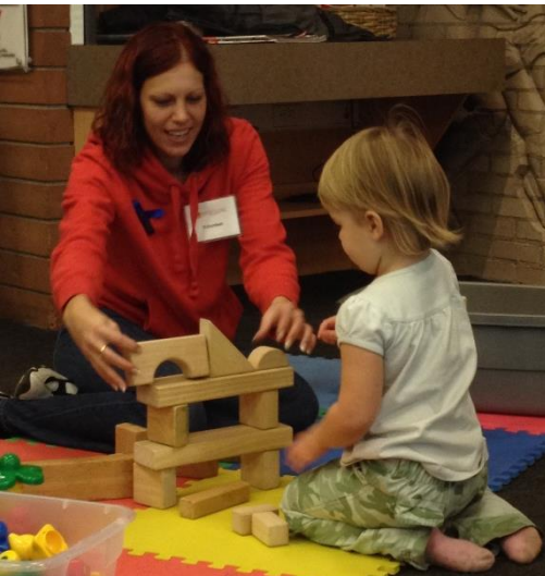
National Child Day Play Place at the Downtown YMCA