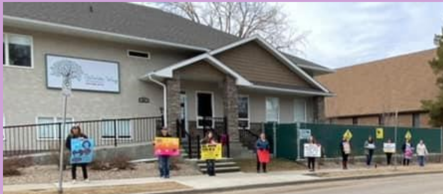
Nature's Way Learning Centre organized a parade with the parents. ECEs held up signs as the families drove by saying how much they missed them.